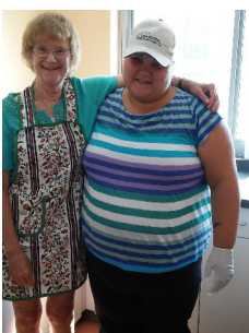
Adams Council on Aging 2015 Host Employer

Please visit www.bcreb.com for information on the region's Career Readiness programming!