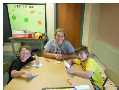
Brayton Elementary School 2015 Host Employer