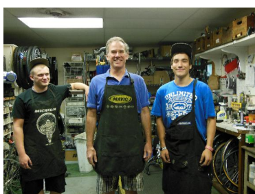
The Spoke 2015 Host Employer